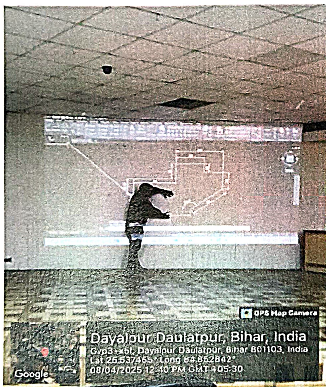
Dayalpur Daulatpur, Bihar, India Gyp3+6j, Dayalpur Daulatpur, Bihar 801103, India Lat 25.537485° Long 84.852842° 08/04/2025 12:40 PM GMT+05:30