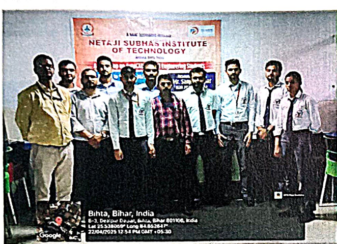
Bihta, Bihar, India 6-3, Daulatpur Daulatpur, Bihar 801106, India Lat 25.533609° Long 84.852842° 22/04/2025 12:54 PM GMT+05:30